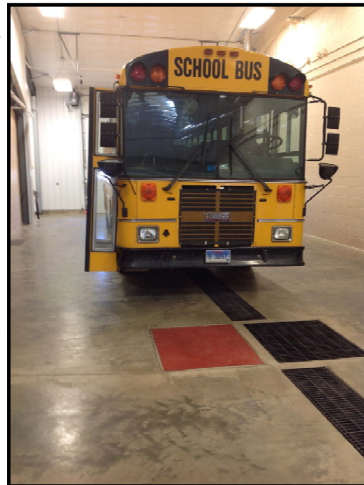
One of the school busses in the wash bay that was built into the new bus barn.

Although many students do not think that this affects them, in all reality, it is indirectly impacting every student. With buses now hav-