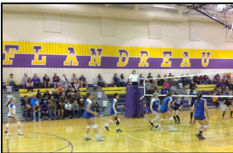
The Lady Blue Dragons await the Flandreau Fliers ball return after a strong play at the net during Region play on Tuesday.

Now that the volleyball season has come to a close for the ladies of Garretson, the girls are moving on to other sports or activities until next year. Congratulations on the season, and better luck next year!